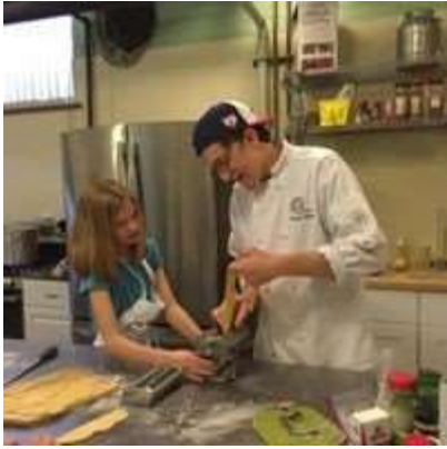
Making pasta at The Projects