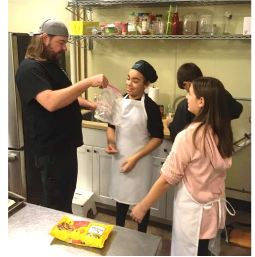
Learning about Chocolate Chip Cookies

To register for THE PROJECTS contact us: 630-834-3440 or Jbruschuk@aol.com