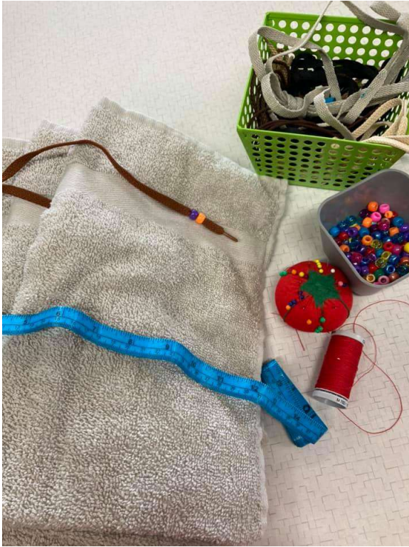
Sewing Projects: Blessings Bags for Homeless Teens